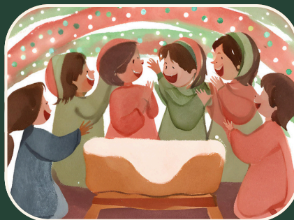
CHILDRENS' CHRISTMAS PAGEANT AND CHORUS