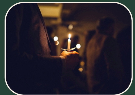
CHRISTMAS EVE SERVICES